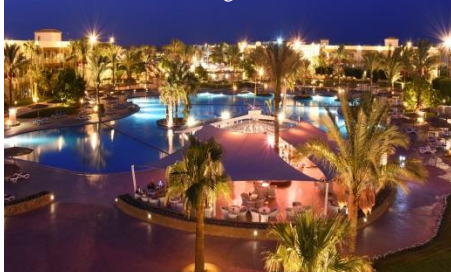
Desert Rose Resort- Hurghada